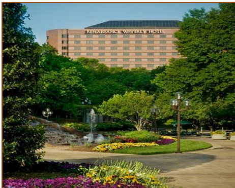
Atlanta Renaissance Waverly

Save the Dates July 15-18, 2012 “Education & Economic Development Summit” GACTE 65 th Annual Summer Leadership Conference